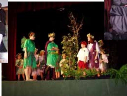
A Midsummer's Night Dream—2003