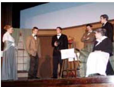
The Hound of the Baskervilles—2004